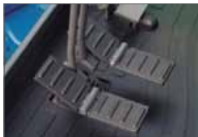
Large Traction pedals

The accumulator is installed as to depressurized auxiliary line and lower attachments in emergency.