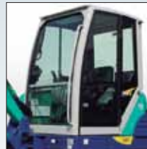
Steel Cabin (Option)