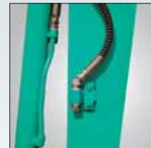
Auxiliary Hydraulic Piping (Standard)