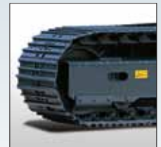
Steel Shoe (Optional)