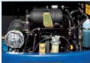
Larger engine adopted.

The engine cover, right side cover all can easily be fully opened.